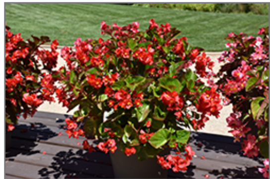
Whopper Red Green Leaf Begonia flowers