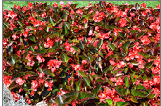
Big Red Bronze Leaf Begonia in bloom

Big Red Bronze Leaf Begonia is a fine choice for the garden, but it is also a good selection for planting in outdoor containers and hanging baskets. It is often used as a 'filler' in the 'spiller-thriller-filler' container combination, providing a mass of flowers and foliage against which the larger thriller plants stand out. Note that when growing plants in outdoor containers and baskets, they may require more frequent waterings than they would in the yard or garden.