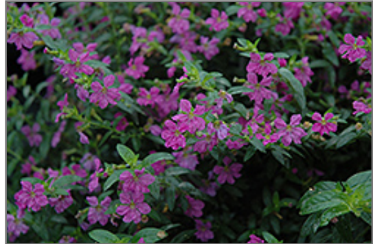
Allyson Mexican Heather flowers