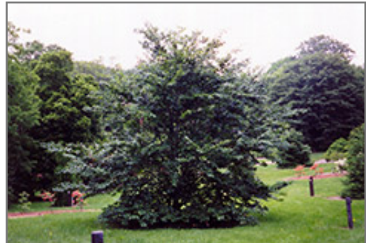
American Beech