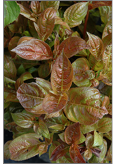
Wings Of Fire Weigela foliage

This shrub should only be grown in full sunlight. It prefers to grow in average to moist conditions, and shouldn't be allowed to dry out. It is not particular as to soil type or pH. It is highly tolerant of urban pollution and will even thrive in inner city environments. This is a selected variety of a species not originally from North America.