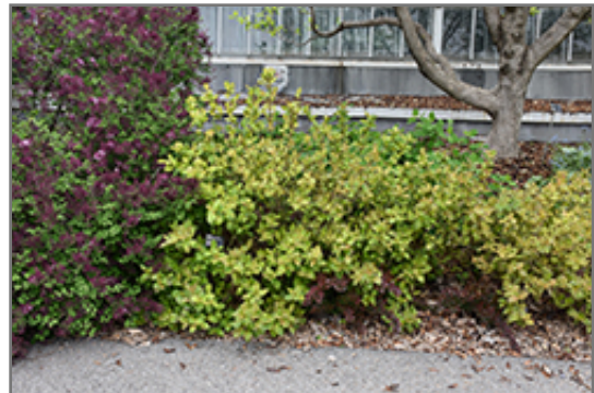
Wings Of Fire Weigela