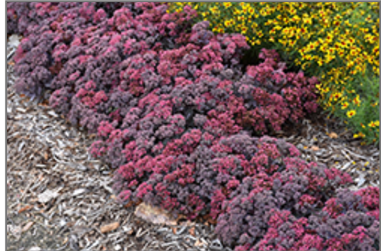
Dazzleberry Stonecrop in bloom

Dazzleberry Stonecrop is a fine choice for the garden, but it is also a good selection for planting in outdoor pots and containers. It is often used as a 'filler' in the 'spiller-thriller-filler' container combination, providing a mass of flowers and foliage against which the larger thriller plants stand out. Note that when growing plants in outdoor containers and baskets, they may require more frequent waterings than they would in the yard or garden.