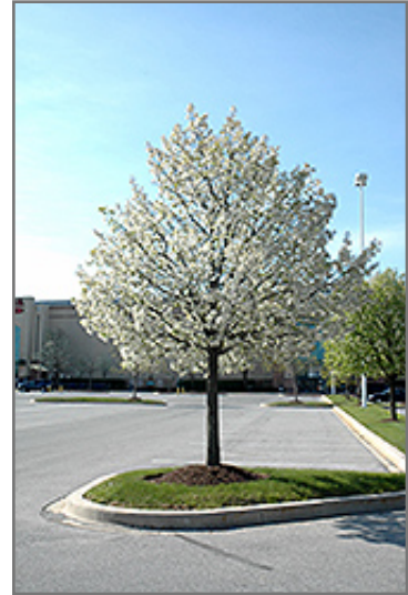
Jack Ornamental Pear in bloom

Jack Ornamental Pear will grow to be about 15 feet tall at maturity, with a spread of 10 feet. It has a low canopy with a typical clearance of 3 feet from the ground, and is suitable for planting under power lines. It grows at a fast rate, and under ideal conditions can be expected to live for 50 years or more.