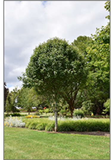
Jack Ornamental Pear

This tree should only be grown in full sunlight. It prefers to grow in average to moist conditions, and shouldn't be allowed to dry out. It is not particular as to soil type or pH. It is highly tolerant of urban pollution and will even thrive in inner city environments. This is a selected variety of a species not originally from North America.