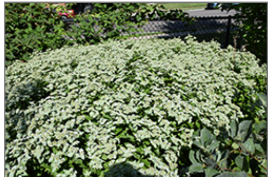
Short Toothed Mountain Mint in bloom