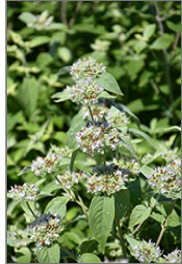
Short Toothed Mountain Mint flowers

Short Toothed Mountain Mint is recommended for the following landscape applications;