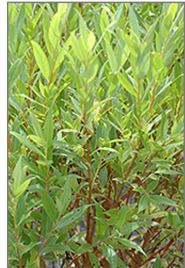
Flame Willow foliage