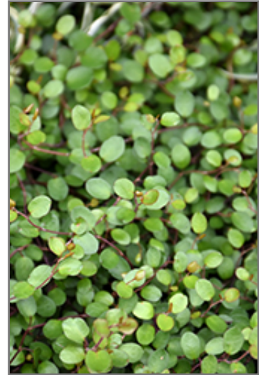
Creeping Wire Vine foliage