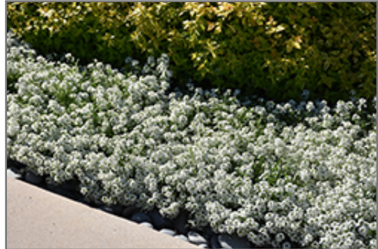
Snow Princess Alyssum in bloom

Snow Princess Alyssum is a fine choice for the garden, but it is also a good selection for planting in hanging baskets. Because of its trailing habit of growth, it is ideally suited for use as a 'spiller' in the 'spiller-thriller-filler' container combination; plant it near the edges where it can spill gracefully over the pot. Note that when growing plants in outdoor containers and baskets, they may require more frequent waterings than they would in the yard or garden.