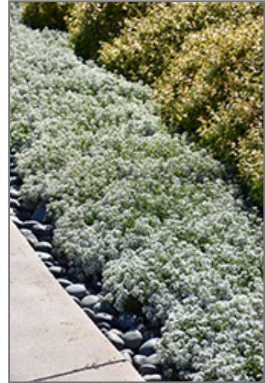
Snow Princess Alyssum in bloom

Snow Princess Alyssum is recommended for the following landscape applications;