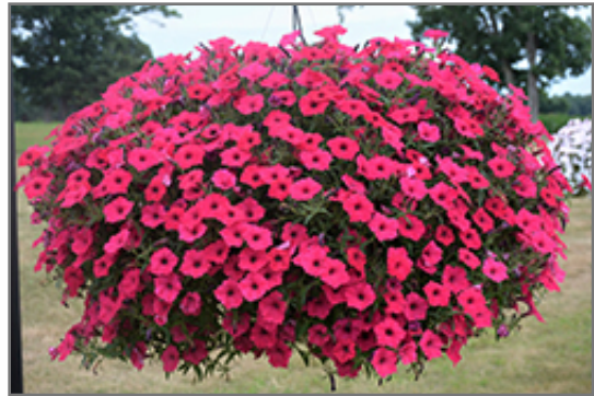
Supertunia Vista Fuchsia Petunia in bloom