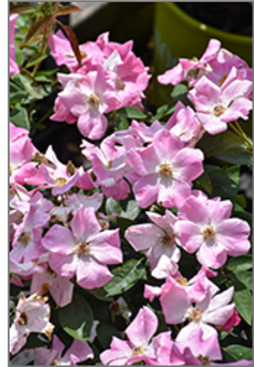
Nearly Wild Rose flowers

Nearly Wild Rose is recommended for the following landscape applications;