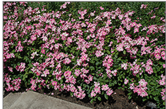
Nearly Wild Rose in bloom