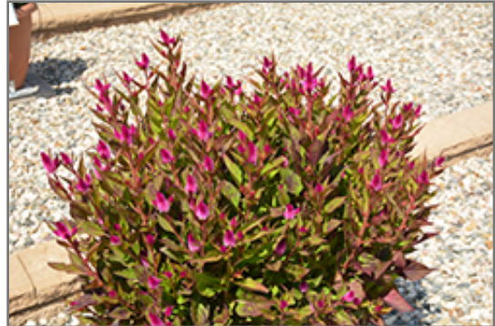
Intenz Classic Celosia in bloom

Intenz Classic Celosia will grow to be about 14 inches tall at maturity, with a spread of 12 inches. When grown in masses or used as a bedding plant, individual plants should be spaced approximately 10 inches apart. Its foliage tends to remain dense right to the ground, not requiring facer plants in front. This fast-growing annual will normally live for one full growing season, needing replacement the following year.