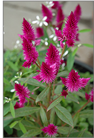
Intenz Classic Celosia flowers

Intenz Classic Celosia is recommended for the following landscape applications;