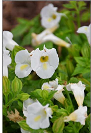
Catalina White Linen Torenia flowers