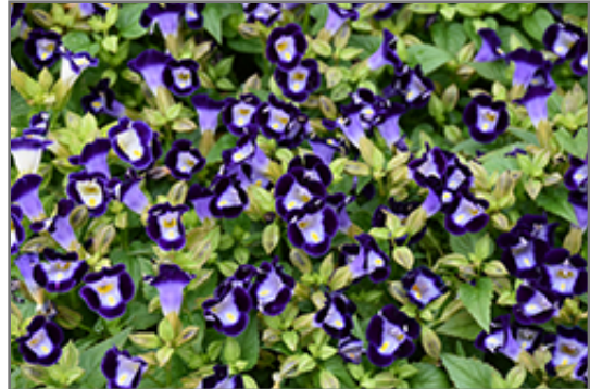
Catalina Midnight Blue Torenia flowers

Catalina Midnight Blue Torenia is recommended for the following landscape applications;