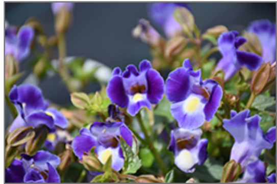
Catalina Midnight Blue Torenia flowers