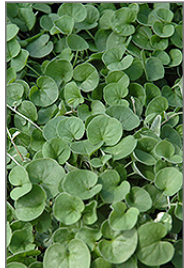
Emerald Falls Dichondra foliage