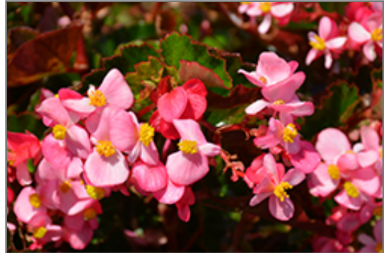
BabyWing Pink Begonia flowers