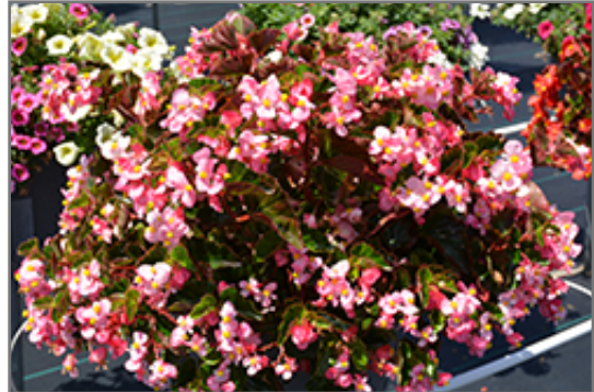
BabyWing Pink Begonia in bloom

BabyWing Pink Begonia is a fine choice for the garden, but it is also a good selection for planting in outdoor containers and hanging baskets. It is often used as a 'filler' in the 'spiller-thriller-filler' container combination, providing a mass of flowers and foliage against which the thriller plants stand out. Note that when growing plants in outdoor containers and baskets, they may require more frequent waterings than they would in the yard or garden.