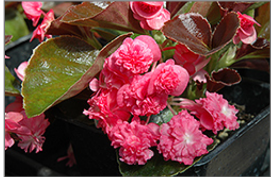
Doublet Rose Begonia flowers

Doublet Rose Begonia is recommended for the following landscape applications;