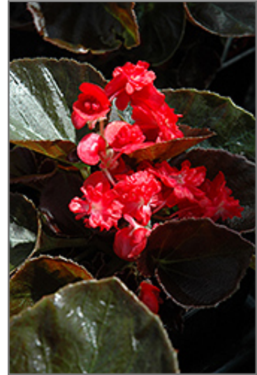
Doublet Red Begonia flowers

Doublet Red Begonia is recommended for the following landscape applications;