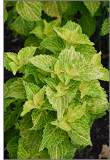
Electric Lime Coleus foliage