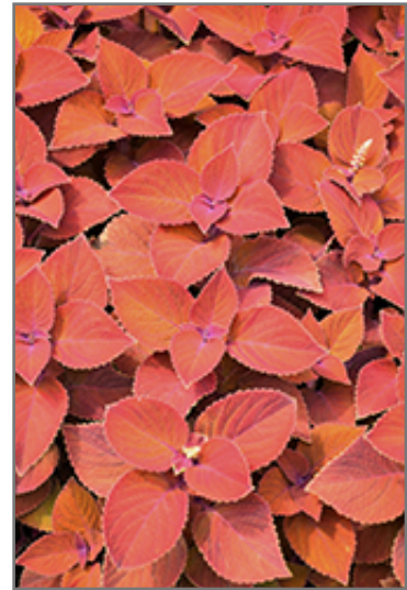
ColorBlaze Sedona Sunset Coleus foliage