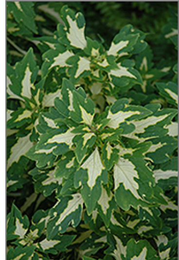
ColorBlaze Alligator Tears Coleus foliage