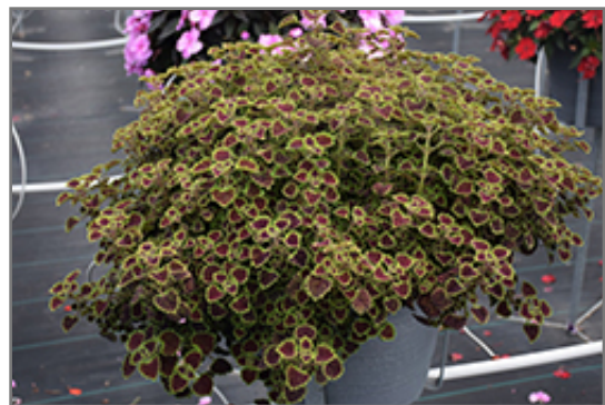
Burgundy Wedding Train Coleus