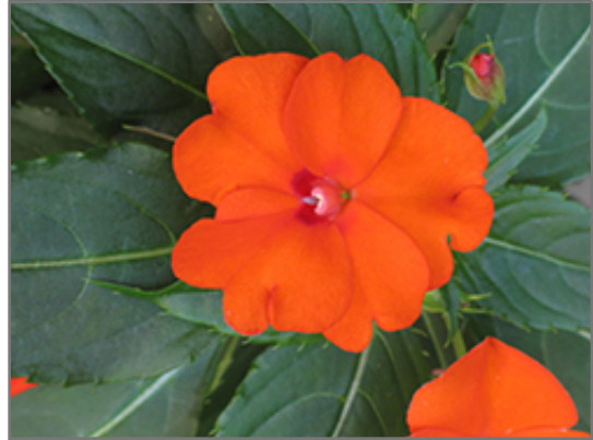
Infinity Orange New Guinea Impatiens flowers

Infinity Orange New Guinea Impatiens is recommended for the following landscape applications;