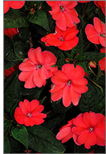
SunPatiens Compact Coral New Guinea Impatiens flowers