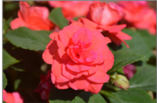
Rockapulco Coral Reef Impatiens flowers