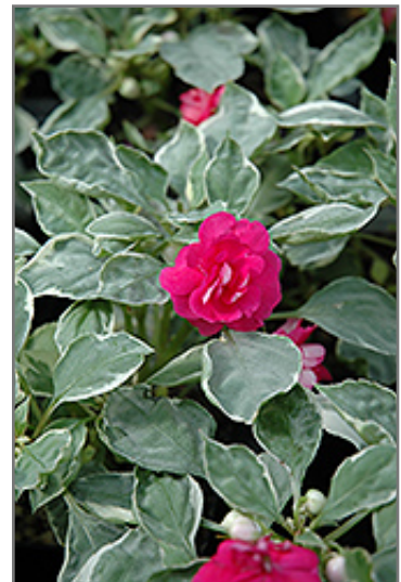
Fiesta Ole Peppermint Double Impatiens flowers