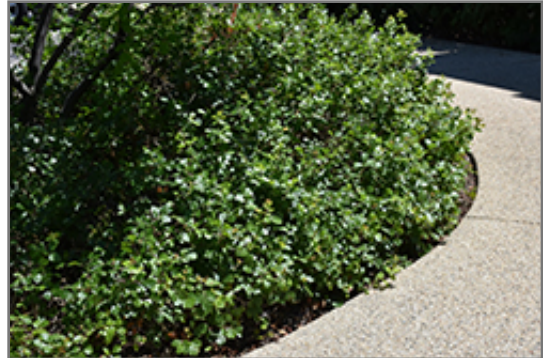
Gro-Low Fragrant Sumac