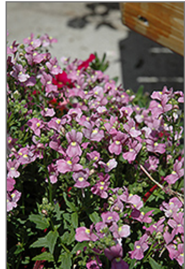
Compact Pink Innocence Nemesia flowers