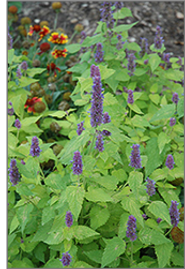
Golden Jubilee Anise Hyssop flowers

Golden Jubilee Anise Hyssop is recommended for the following landscape applications;