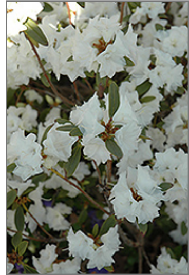
April Snow Rhododendron flowers