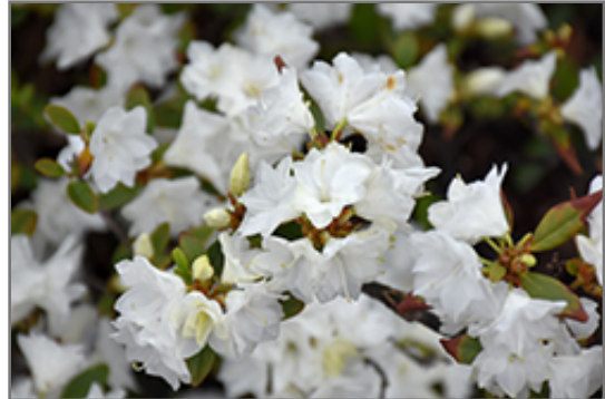
April Snow Rhododendron flowers