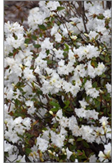
April Snow Rhododendron flowers

This shrub does best in full sun to partial shade. You may want to keep it away from hot, dry locations that receive direct afternoon sun or which get reflected sunlight, such as against the south side of a white wall. It requires an evenly moist well-drained soil for optimal growth, but will die in standing water. It is very fussy about its soil conditions and must have rich, acidic soils to ensure success, and is subject to chlorosis (yellowing) of the foliage in alkaline soils. It is somewhat tolerant of urban pollution, and will benefit from being planted in a relatively sheltered location. Consider applying a thick mulch around the root zone in winter to protect it in exposed locations or colder microclimates. This particular variety is an interspecific hybrid.