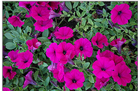
Wave Purple Classic Petunia flowers