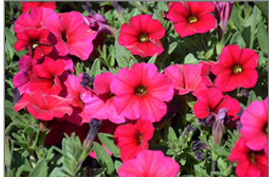
SuperCal Cherry Petchoa flowers

SuperCal Cherry Petchoa is recommended for the following landscape applications;