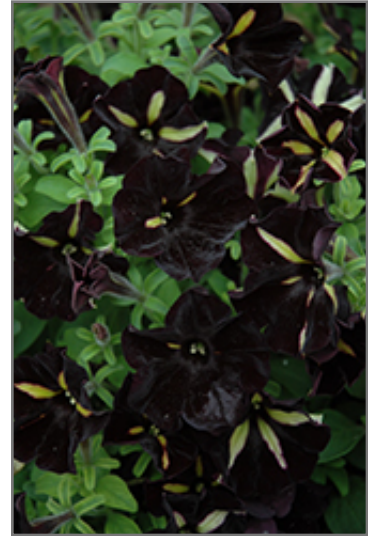
Phantom Petunia flowers