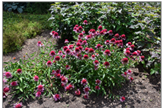
Double Scoop Bubble Gum Coneflower in bloom