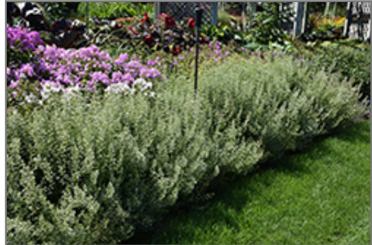
Montrose White Dwarf Calamint in bloom

Montrose White Dwarf Calamint is a fine choice for the garden, but it is also a good selection for planting in outdoor pots and containers. It is often used as a 'filler' in the 'spiller-thriller-filler' container combination, providing a mass of flowers against which the larger thriller plants stand out. Note that when growing plants in outdoor containers and baskets, they may require more frequent waterings than they would in the yard or garden.