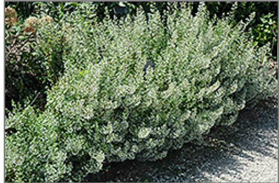
Montrose White Dwarf Calamint in bloom