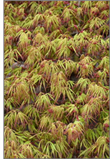
Spring Delight Japanese Maple foliage