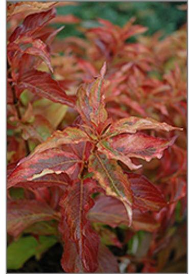
My Monet Sunset Weigela in fall

My Monet Sunset Weigela makes a fine choice for the outdoor landscape, but it is also well-suited for use in outdoor pots and containers. It is often used as a 'filler' in the 'spiller-thriller-filler' container combination, providing a mass of flowers and foliage against which the thriller plants stand out. Note that when grown in a container, it may not perform exactly as indicated on the tag - this is to be expected. Also note that when growing plants in outdoor containers and baskets, they may require more frequent waterings than they would in the yard or garden.