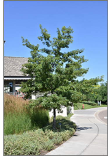
Majestic Skies Northern Pin Oak