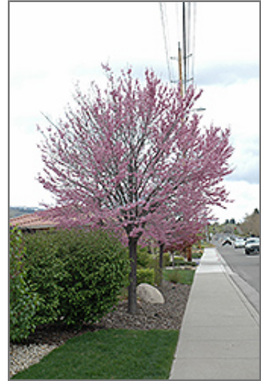
Eastern Redbud (tree form) in bloom

This tree does best in full sun to partial shade. It prefers to grow in average to moist conditions, and shouldn't be allowed to dry out. It is not particular as to soil type or pH. It is highly tolerant of urban pollution and will even thrive in inner city environments, and will benefit from being planted in a relatively sheltered location. Consider applying a thick mulch around the root zone in winter to protect it in exposed locations or colder microclimates. This is a selection of a native North American species.