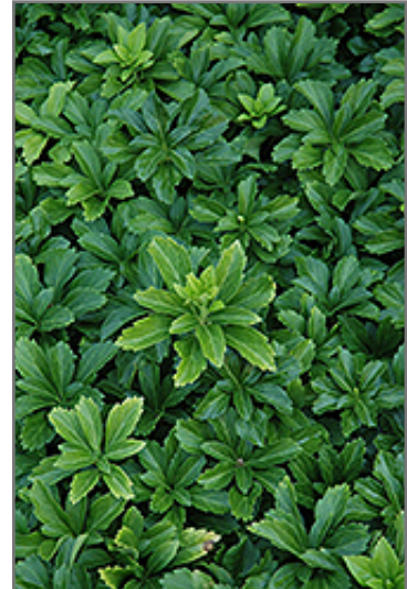
Green Sheen Japanese Spurge foliage