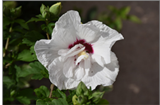
Bali Rose of Sharon flowers