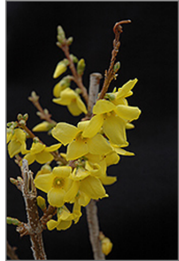
Show Off Forsythia flowers

Show Off Forsythia makes a fine choice for the outdoor landscape, but it is also well-suited for use in outdoor pots and containers. With its upright habit of growth, it is best suited for use as a 'thriller' in the 'spiller-thriller-filler' container combination; plant it near the center of the pot, surrounded by smaller plants and those that spill over the edges. It is even sizeable enough that it can be grown alone in a suitable container. Note that when grown in a container, it may not perform exactly as indicated on the tag - this is to be expected. Also note that when growing plants in outdoor containers and baskets, they may require more frequent waterings than they would in the yard or garden.