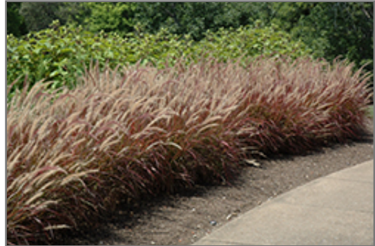
Purple Fountain Grass in bloom

Purple Fountain Grass is a fine choice for the garden, but it is also a good selection for planting in outdoor pots and containers. Because of its height, it is often used as a 'thriller' in the 'spiller-thriller-filler' container combination; plant it near the center of the pot, surrounded by smaller plants and those that spill over the edges. It is even sizeable enough that it can be grown alone in a suitable container. Note that when growing plants in outdoor containers and baskets, they may require more frequent waterings than they would in the yard or garden.