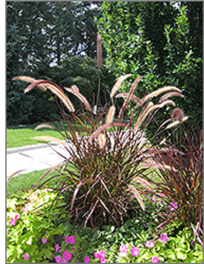
Purple Fountain Grass flowers