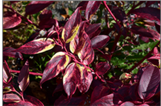
Rainbow Fetterbush in fall

Rainbow Fetterbush will grow to be about 5 feet tall at maturity, with a spread of 6 feet. It tends to fill out right to the ground and therefore doesn't necessarily require facer plants in front, and is suitable for planting under power lines. It grows at a medium rate, and under ideal conditions can be expected to live for approximately 20 years.