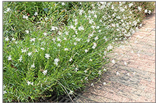
Whirling Butterflies Gaura in bloom