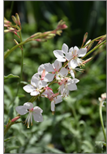
Whirling Butterflies Gaura flowers

Whirling Butterflies Gaura is recommended for the following landscape applications;