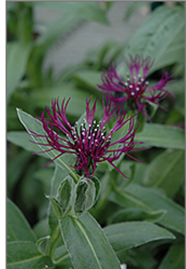
Amethyst Dream Cornflower flowers