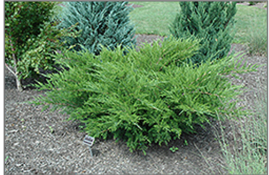
Sea Green Juniper