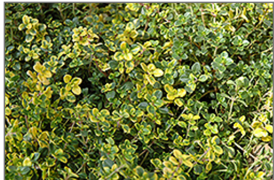
Doone Valley Thyme